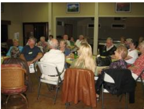
paying rapt attention to the Red Feather Mystery play.