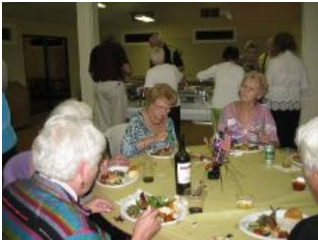
Enjoying the meal and....