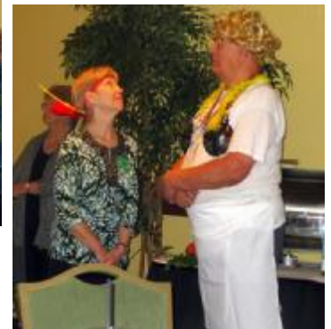
And some of our lighter moments.....