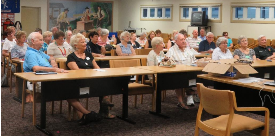
FF Sarasota members listening to Patda at 9/21/16 meeting on topic 'Visit Sarasota' for our January Global Exchange.

Meet our Members – We will highlight new and current members each month. The membership committee will be reaching out to you and we're looking forward to knowing each of our members better. We'd also like to include photos in future editions.